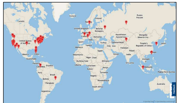
A snapshot of Internet traffic for a recent two-week period: red markers show that eaglelake1.org has a global reach!

eaglelake1.org has recently passed the 100,000 page-view mark, and the various lake cameras and the photo album continue to account for a large percentage of traffic to the site. Maps and environmental issues rank right up there, too.